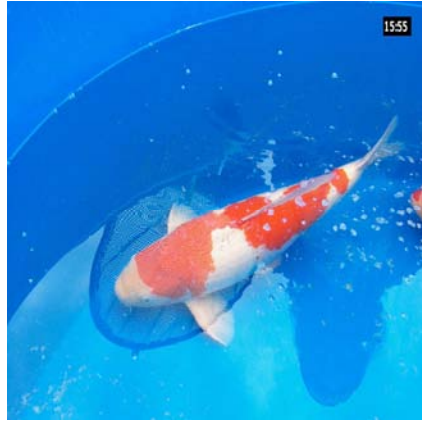
Reserve Champion Kohaku Size 5 Tom Ayers