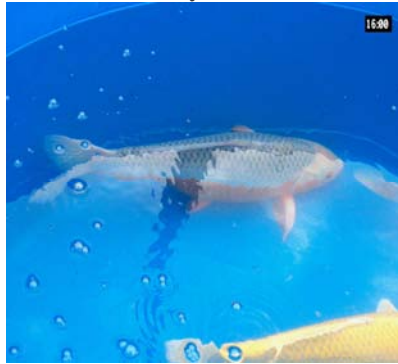
B Champion Asagi Size 6 Tom Ayers