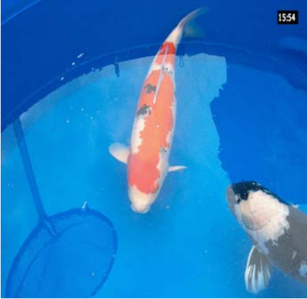
Grand Champion Sanke Size 6 Tom Ayers