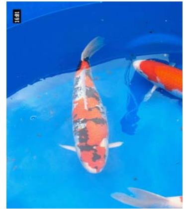
Male Champion A Ginrin Size 5 Tom Ayers